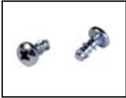
Mounting Boss Screws are Available for Purchase (4-24 X 1/4 Inch Thread Forming Screw) Bag of 100, $2.50