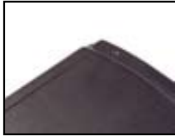
Textured Area for Consistent Surface