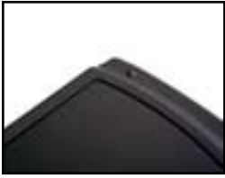
Smooth Area for Graphic Overlays or Membrane Keypads