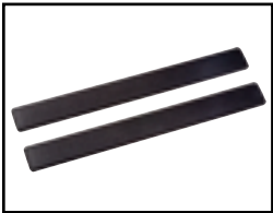
End Panels (2): Easily Modified for Switches, Displays and Connectors