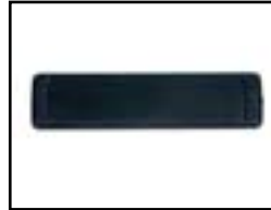
End Panel (1): Easily Modified for Switches, Displays and Connectors