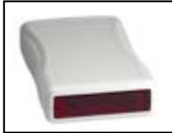
Optional Infrared Panel