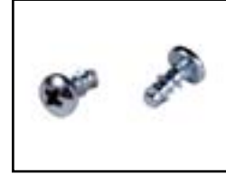
Mounting Boss Screws are Available for Purchase (4-24 X 1/4 Inch Thread Forming Screw) Bag of 100, $2.50