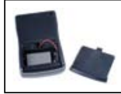
Battery Compartment: 9 Volt