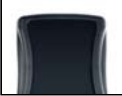
Smooth Area for Graphic Overlays or Membrane Keypads