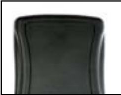
Textured Area for Consistent Surface