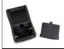
Battery Compartment: AA