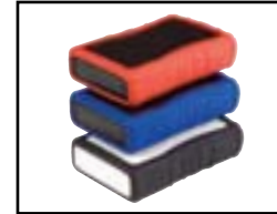
Flexible Boot Available in Red, Blue or Black