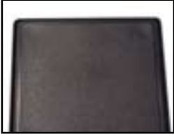
Textured Area for Consistent Surface