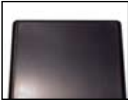
Smooth Area for Graphic Overlays or Membrane Keypads (TF-2420TX & TF-3420TX only)