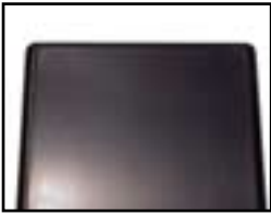
Smooth Area for Graphic Overlays or Membrane Keypads (P-2420TX & P-3420TX only)