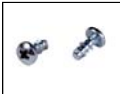
Mounting Boss Screws are Available for Purchase (4-24 X 1/4 Inch Thread Forming Screw) Bag of 100, $2.50