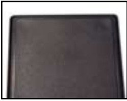
Textured Area for Consistent Surface