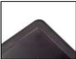
Smooth Area for Graphic Overlays or Membrane Keypads