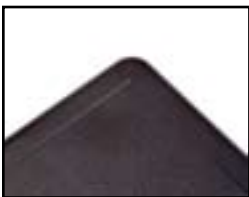
Textured Area for Consistent Surface