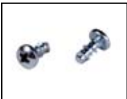
Mounting Boss Screws are Available for Purchase (4-24 X 1/4 Inch Thread Forming Screw) Bag of 100, $2.50