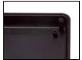
PCB Mounting Bosses (KT-70 only)