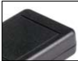
Flush/Textured Area for Consistent Surface