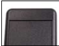
Recessed/Textured Area (KT-45 only)