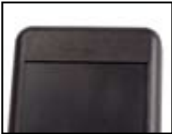
Recessed/Smooth Area for Graphic Overlays or Membrane Keypads