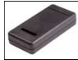
Ribbon Cable Slot (KT-45 only)