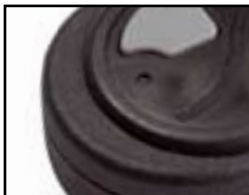
Clear Silicone Rubber Light Emission LED