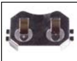
Battery Holder Available for Purchase, Fits 20mm Coin Cell Battery