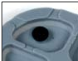
Conductive Contact on the Bottom of Each Button