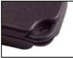
Molded-in Key Ring