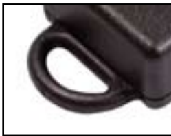
Molded-in Key Ring