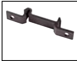
Versatile Snap-on Clip for Mounting